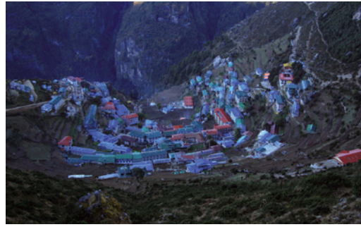
Figure 3 – Namche Bazaar in 1955 and 2010. Today Namche has grown significantly and is the administrative centre and headquarters for SNPBBZ authorities. Namche's monastery (gompa), centre right, with yellow roof and surrounding sacred grove (Lu), has grown in size.