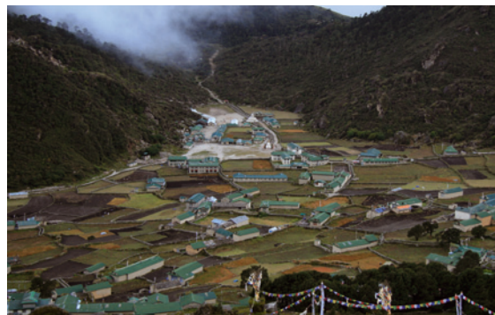
Figure 5 – Khumjung in 1966 and 2011. The photograph was taken en route to the bird sanctuary. The school (Khumjung School) and group of lodges at the village's south entrance (2011) has become the new civic space of the settlement. The settlement's sacred forested grove (Lu) surrounding the monastery is shown. The forested areas are decorated with prayer flags extolling the virtues of trees and forests and the pertinence of planting and caring for them (Tenzing Tashi Sherpa pers. comm. 2011) – a landscape of conservation ideology. Part of the recent complexes of what the author terms dooryard gardens used for intensive potato cultivation are shown.

rials until the vegetation was destroyed by cattle used for Everest expeditions. "It's beautiful, the forest. We need forest here. It's good ... The relationship between the national park staff and the local people does not help these forests ... the National Park is always looking for Sherpa mistakes ... which has caused more chopping or cutting of trees. We used to have thicker forests around here."