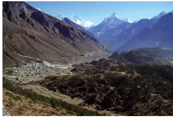
Figure 4 – The villages of Kunde and Khumjung in 1961 and 2009. Both villages have increased in size by more than 50% between 1961 and 1995 (Byers 2005), an increase largely attributed to population growth (Stevens 2003). These growth trends appear to be continuing as of 2011 (Ang Rita Sherpa pers. comm.). There has been an increase in trees in the forest, centre right, which is a mixture of protected (Kyaksbing) and sacred forest groves (Lami nati). The area of vegetation on the slope behind both villages and the left slope behind the village of Kunde (Gyajo Valley) has increased perhaps two- to threefold, probably due to an increase in vegetation and new plantings (Tenzing Tashi Sherpa pers. comm. 2011). The U-shaped valley is characterized by sandy, nutrient poor, former lake and alluvial terraces.