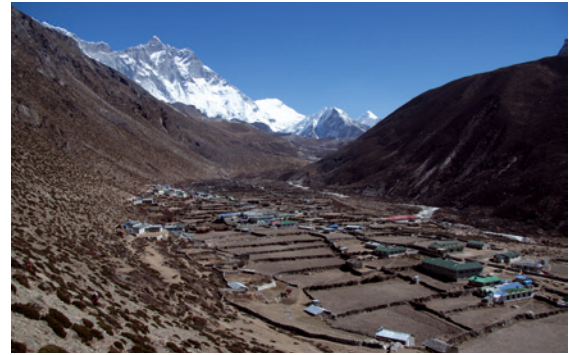
Figure 6 – Dingboche village in 1977 and 2011. The spectacular terracing so ubiquitous in SNPBZ is shown and has historical origins. Note the apparent increase in juniper cover on alpine slopes upstream of Dingboche, most likely related to a locally imposed ban on juniper cutting since 2004. Dingboche was traditionally a summer pasture (gunsa) area but is now inhabited year-round due to tourism development and is one of the remaining villages that impose D-system (communal regulation of livestock system). The village has grown in size since the late 1990s due to trekkers preferring the sunnier side of the upper Imja valley and the popular climb of Imjaste (Island Peak 6032 m) centre-right.