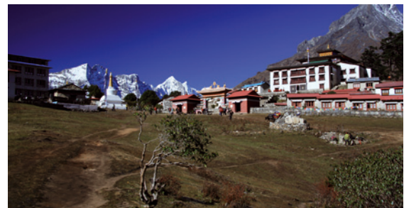
Figure 7 – Tengboche Monastery in 1951 and 2010. The monastery has been the heart of Sherpa culture since 1916. The 1951 photograph was taken on the British Mt. Everest reconnaissance expedition. The monastery was reconstructed in 1989 after a fire, to look similar to the former design from the outside. Surrounding Tengboche are well-established community-protected forests (Kyakshing) and sacred forest groves (Lu). Different focal length and vegetation prevented an exact repeat.

sense of mourning for traditional agro-pastoral values, on the one hand, and welcoming earning opportunities on the other.